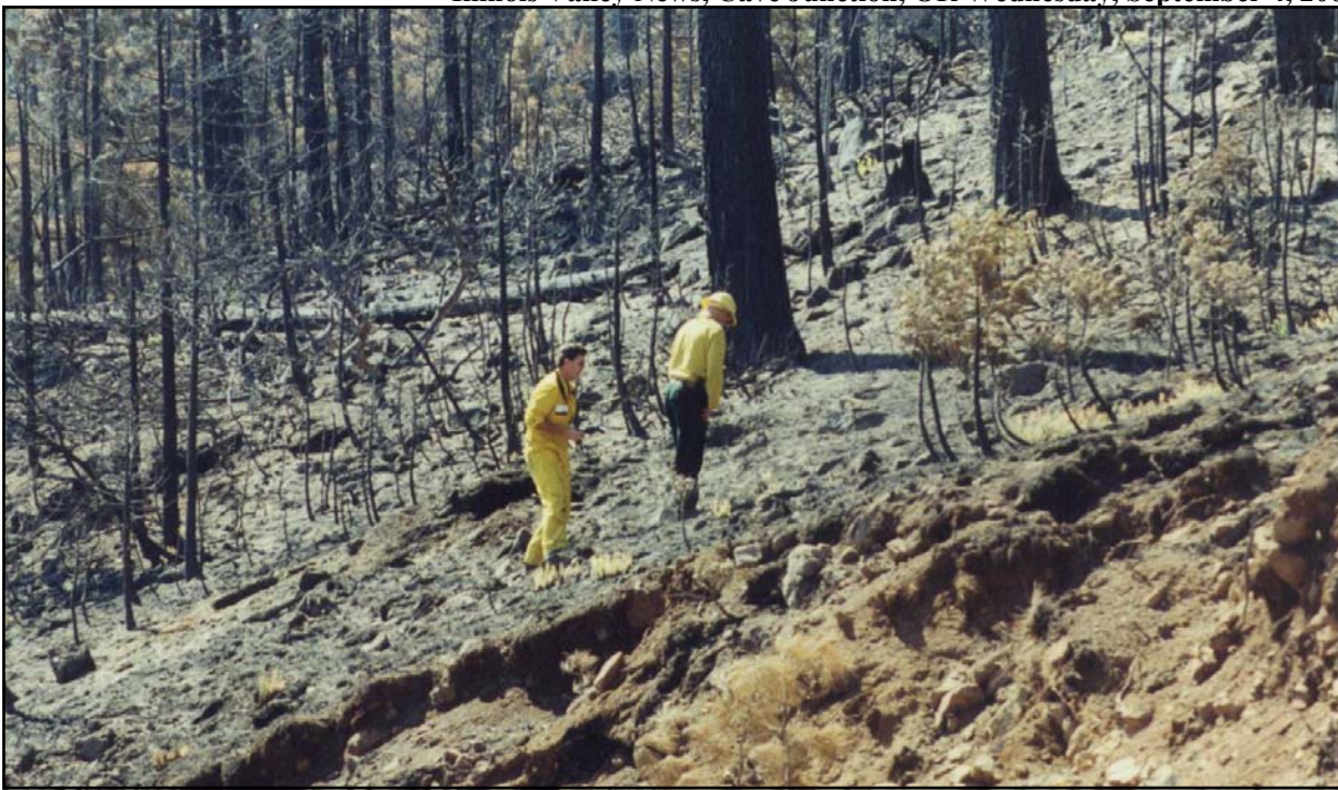
(Clockwise, from top left) BAER team leader Jon Brazier (at right) points out new shoots in the Biscuit Fire interior to an AP reporter; close-up view of a fiddlehead fern growing in the burned area, a month after the fire raged; a view of the more-intensely burned area in the Eight Dollar Road area; Type II crews, from Kentucky and Georgia, doing rehabilitation work on containment lines near Spalding Pond.

Still there is a lot of work to be done, such as piling the slash made as dozers pushed through to create a defensible space between the fire and the valley.