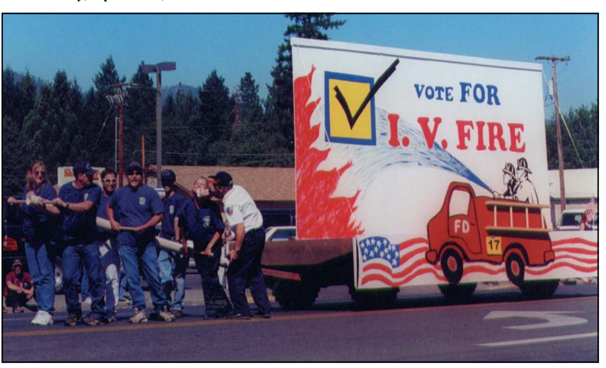
Community enjoys 30th annual Labor Day Festival and Parade sponsored by Illinois Valley Lions Club.