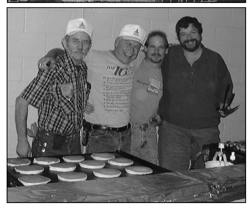
Good Shepherd Lutheran Church