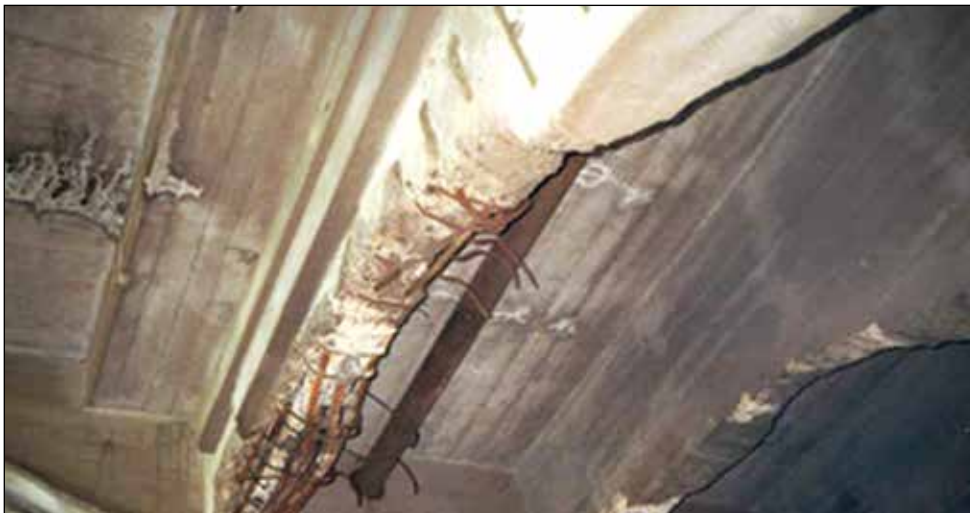
Many bridges in Portland are in critical need of repair like the Bybee bridge, shown above, before it was updated