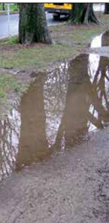
Sidewalks, school in mud or