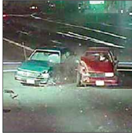
Red light cameras improve safety by dramatically reducing red light violations