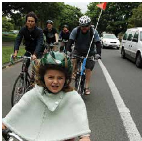
Families can cycle on family-friendly boulevards with low traffic