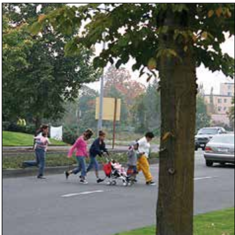
Crossing without crosswalks