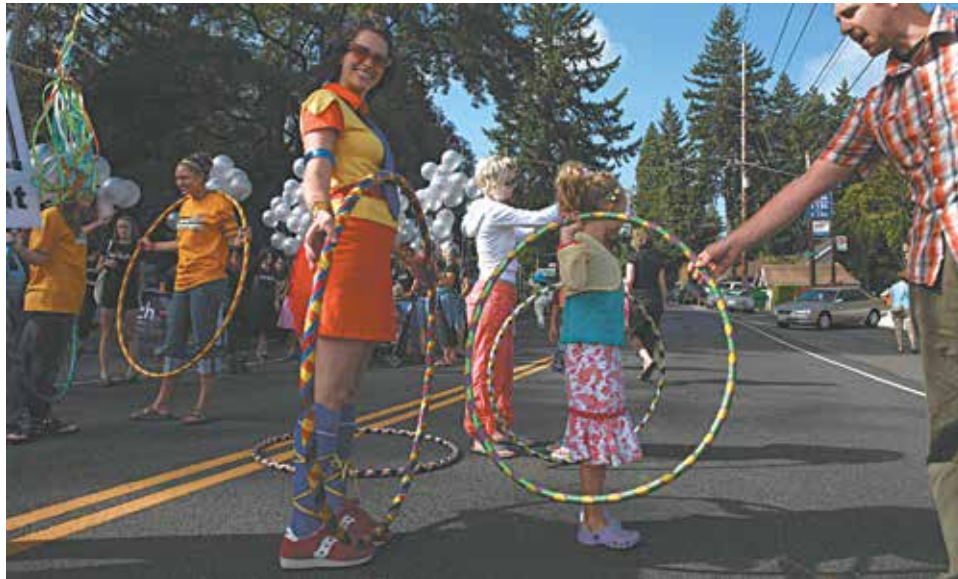
Hoopin' it up in Hooperville