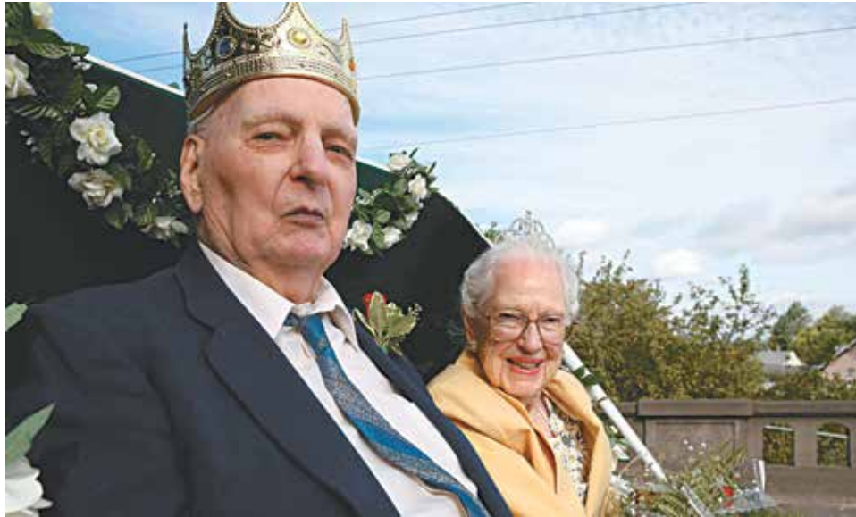
All hail the King and the Queen!