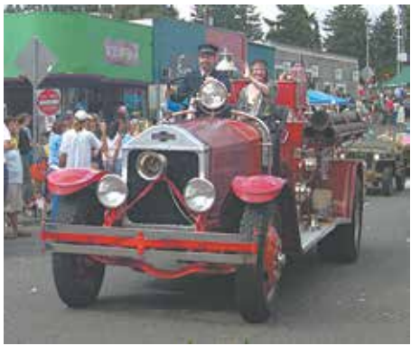
Five-Alarm Antique Fire Engine