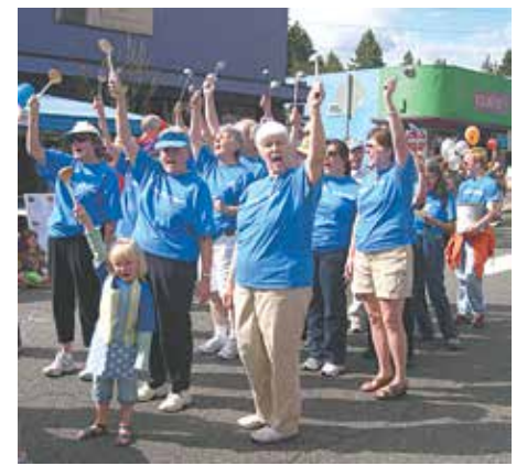
Loaves & Fishes Ladle Drill Team