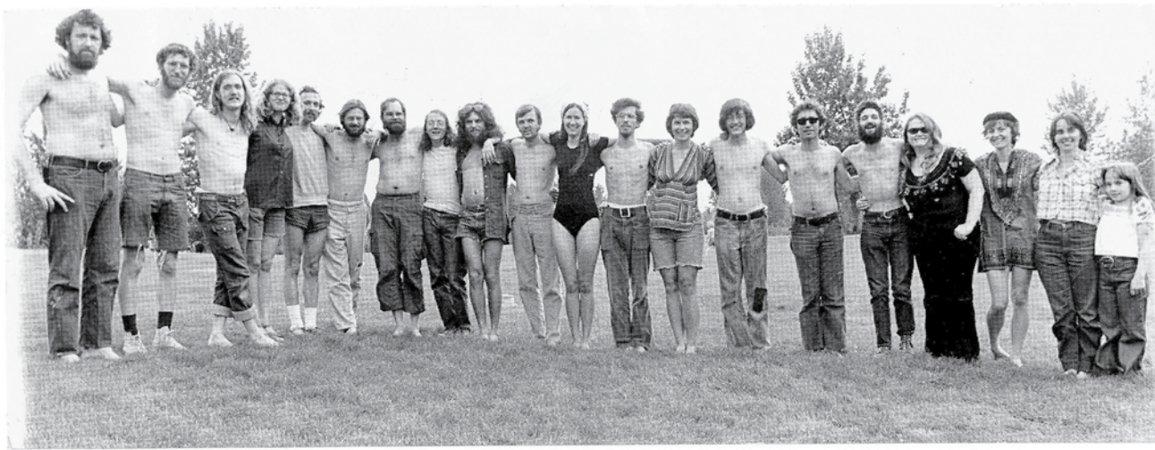
PORTLAND SCRIBE STAFF PICNIC, SUMMER 1974, KELLEY POINT PARK