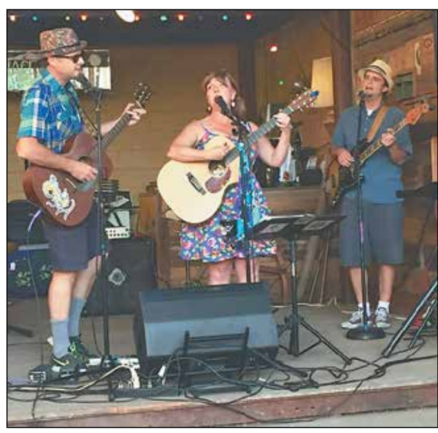
Mojo Holler, a blues and roots band, will perform on Friday, Feb. 10, 8 to 11 p.m. at O'Connor's Vault, 7850 SW Capitol Highway, in Multnomah Village. Visit www.