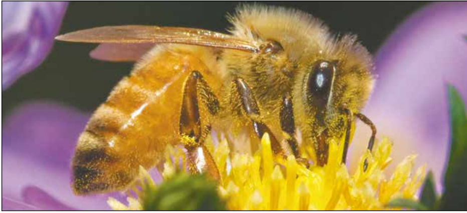
Activists would like the U.S. government to ban a class of insecticides called neonics that they blame for wiping out the bees that pollinate a majority of our food crops.