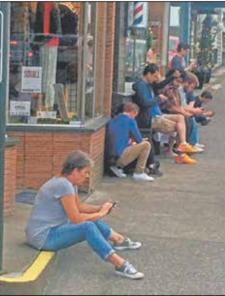
Pokémon Go gamers congregate in Multnomah Village searching for characters to capture.

If you’ve noticed more people hanging out on the streets in Multnomah Village lately, it’s because of the new phenomenon called Pokémon Go. Created by a San Francisco software company, Niantic, Pokémon Go was released on July 6, 2016. Although it does get gamers outside walking instead of sitting in front of screens for hours on end, adults, teenagers, and tweens alike use their phones to hunt for virtual characters with names like Squirtie, Weedle, and Jigglypuff. They can show up anywhere and many have been found near certain businesses in Multnomah Village. Business has been so brisk at some locations that trashcans are overflowing and cigarette butts litter the sidewalk. Pokémon Go has become a worldwide phenomenon attracting over 21 million active users, attracting more users than Twitter. Accidents, cyber safety issues, and trespassing have occurred to players everywhere it’s played. Local leaders urge awareness of potential problems that can take place. According to the Multnomah Village Business Association, trash has been a sore point and business owners have been instructed to pay more attention to the overflow. “At the July meeting we had a rather humorous discussion about all the extra people in the village playing Pokémon Go,” said Randy Bonella, MVBA executive director. “We discussed how to encourage them to pick up after themselves.” One business owner, who wanted to remain anonymous, didn’t find it so (Continued on Page 6)