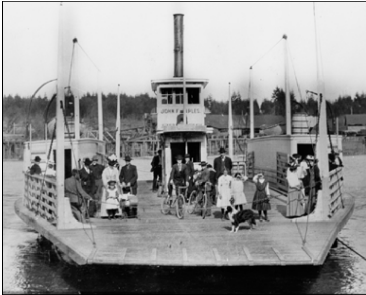
Spokane Street Ferry: The ferry John F. Caples carried folks across the Willamette River between West Portland and Sellwood from 1903 until the Sellwood Bridge was built in 1925.