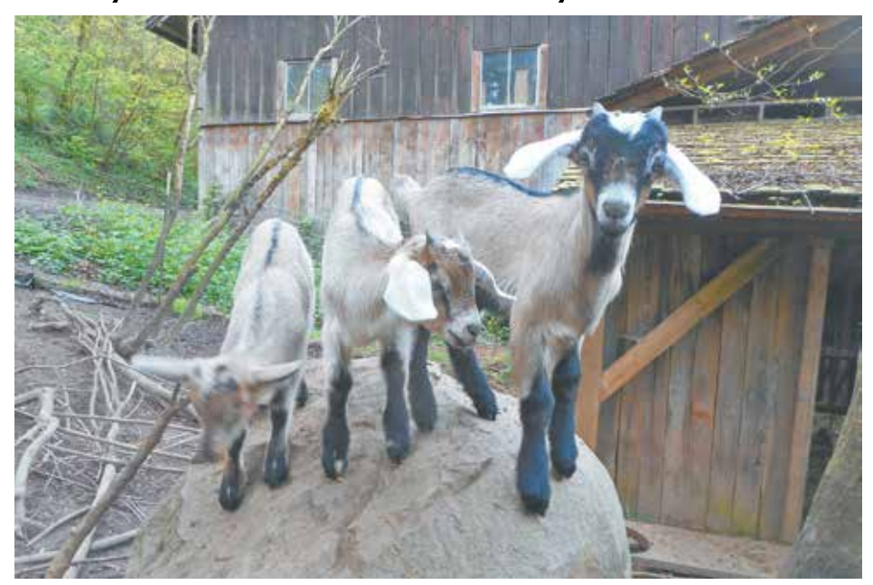
Ten super cute baby goats were born in March at the TLC Farm.

"It's also nice that other adults keep an eye out for them, as I do as well for other