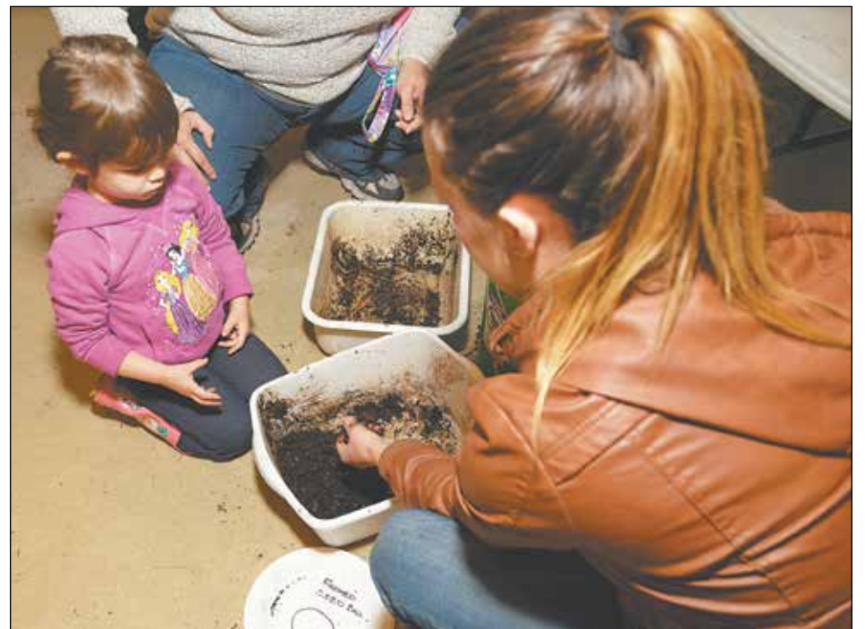
The 36th Annual Trillium Festival & Native Plant Sale is April 2-3 at Tryon Creek State Natural Area.