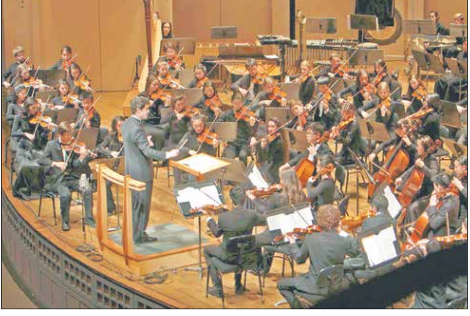
Portland Youth Philharmonic holds its Winter Concert on March 5 at the Arlene Schnitzer Concert Hall.

12 SW Trails PDX is sponsoring a walk on Saturday, March 12,