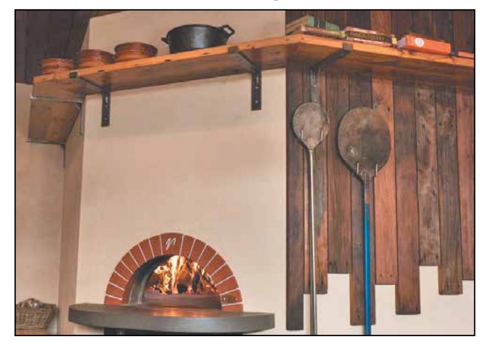
The new Tastebud pizzeria in Multnomah Village features a wood-fired oven.

Doxtader also specialized in growing diverse crops that included unique vegetables, greens, and herbs that were difficult to find in markets.