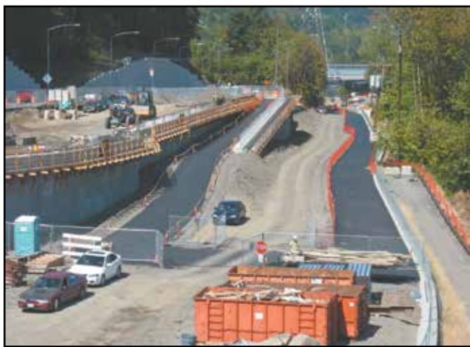
Temporary path between the Sellwood Bridge and Macadam Bay.

should be all completed by now. The contractor is also installing logs for fish habitat. Rocks will be installed at the creek's outfall to the river and the area will be seeded.