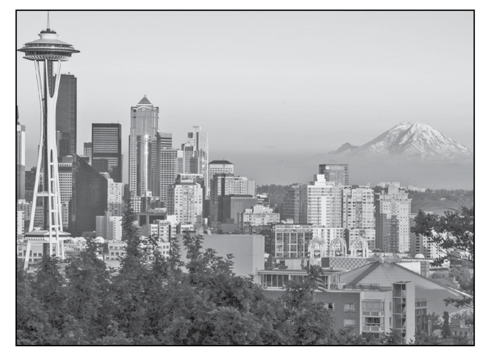
Some consider Seattle and the rest of the Pacific Northwest to be a potential refuge for Americans looking to escape drought-stricken southern states.