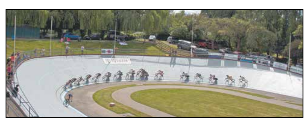
Bicycle track racers return to the Alpenrose Velodrome (6149 SW Shattuck Road) for the 2015 Alpenrose Challenge, July 18-19. Races start at 9 a.m. Saturday and end at 6 p.m. Sunday. Visit www.alpenrosechallenge.com for a complete schedule of events.

20 Become your own publisher: This one-hour community workshop provides authors with some of the tools and guidance necessary to self-publish. The workshop takes place on Monday, July 20, 6:30 to 7:30 p.m. at the Capitol Hill Library, 10723 SW Capitol Hwy., 503-988-5385. Including aspects of professional editing and design, logistics and distribution, and publicity and marketing, this workshop is purely informational, including a