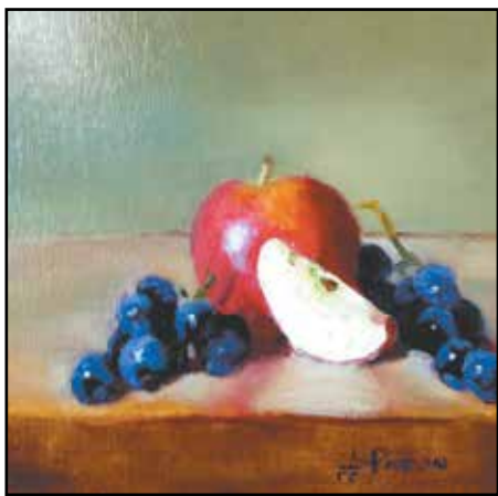
Lynne Patton is one of the 500 artists whose work is for sale at the Big 500.

By KC Cowan and Don Snedecor The Southwest Portland Post