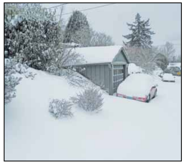
A Multnomah neighbor captured this scene of a street snowed under during her walk, Feb. 8.