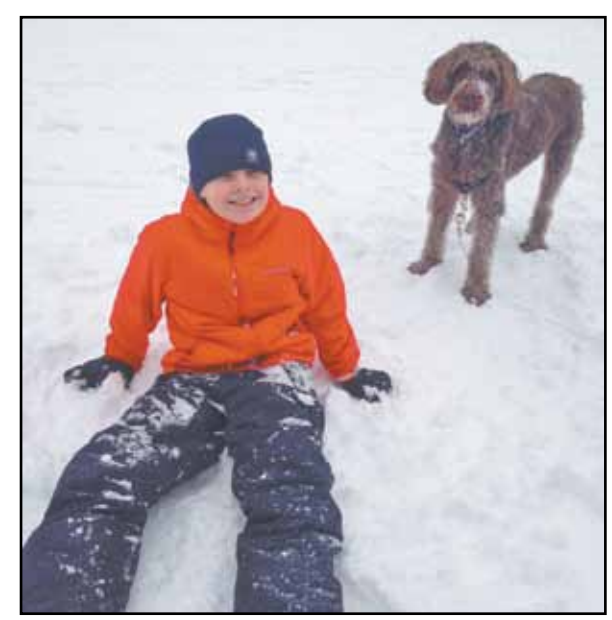
snow, Feb. 7.