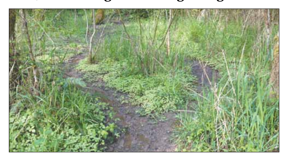
Right now, people entering the wetland trudge through dense vegetation and standing water. Because there aren't any defined trails, narrow and muddy paths criss-cross through the wetland.

By Melinda Hasting The Southwest Portland Post