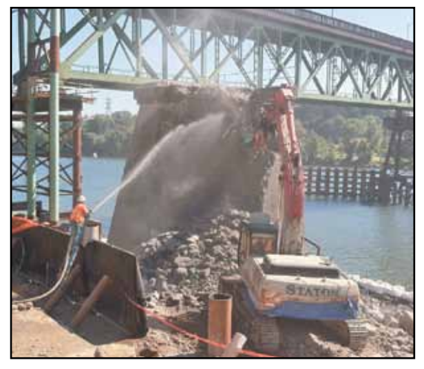
A Sellwood Bridge worker sprays a stream of water at one of the old west piers in July as a way to help control concrete dust during demolition.

"I can't say that everyone is completely satisfied, but most people seem to think this is an improvement," Pullen said.