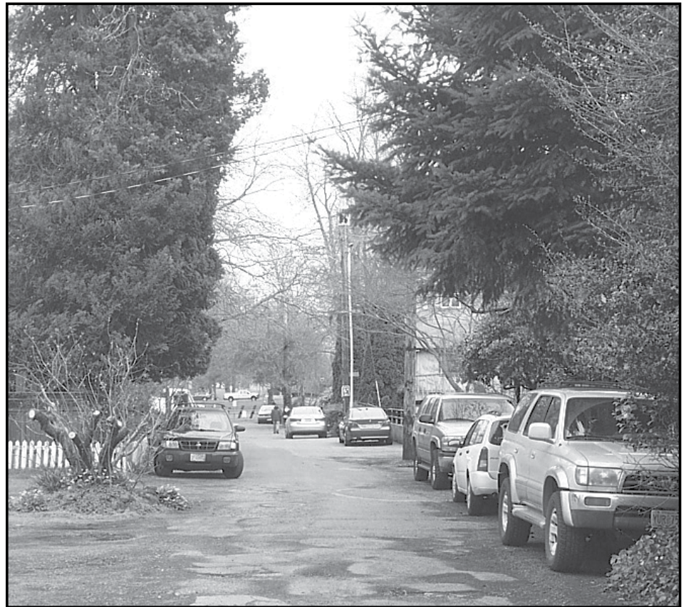
Residents who live along Southwest Miles Place are concerned that a regional trail carrying 6,000 bicyclists per day is coming along with the new Sellwood Bridge.