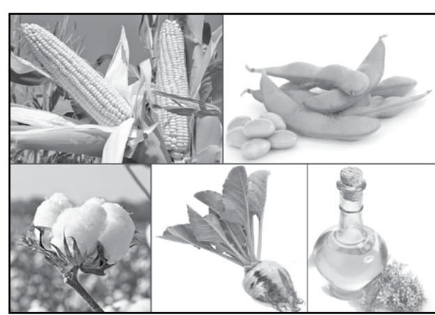
More than 90 percent of U.S.-grown corn, soybeans, cotton, sugar beets and canola are derived from seeds genetically engineered by Monsanto and other companies to resist pests.

"Not only is [GE] labeling a reasonable and common sense solution to the continued controversy that corpora-