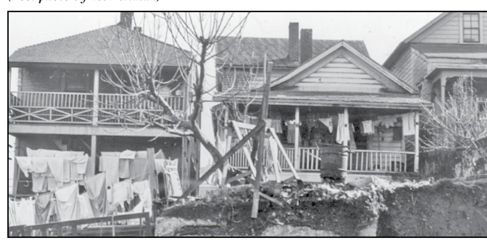
Houses in the South Auditorium Renewal Area in South Portland circa 1962.