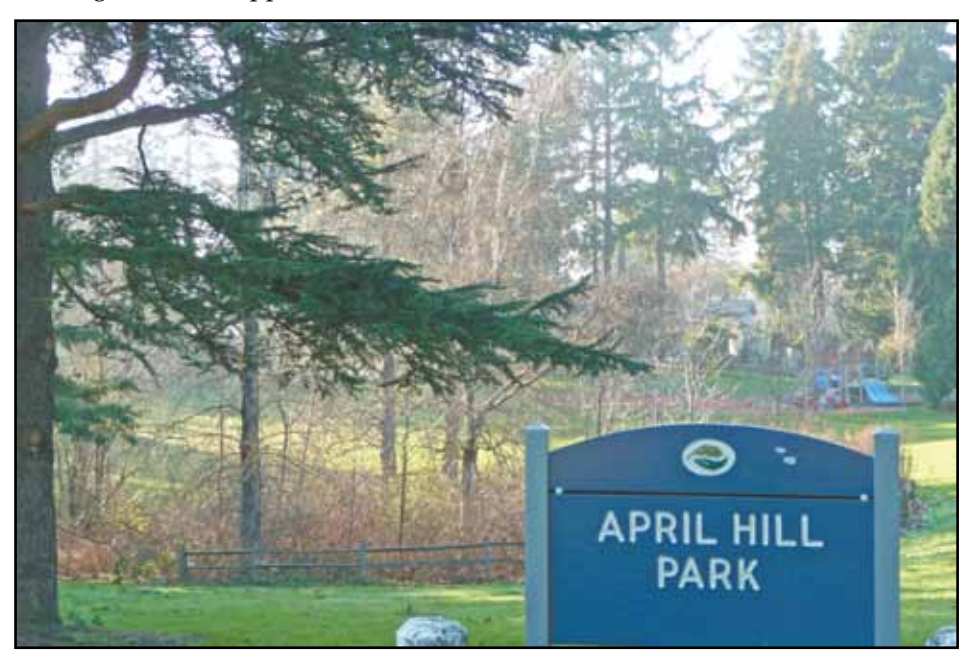
Maplewood Neighborhood Association is looking to add a boardwalk over wetlands and a bridge across Woods Creek at April Hill Park.

Construction on the project could begin in 2014, and it has an estimated cost, including in-kind donations of labor, of $100,000.