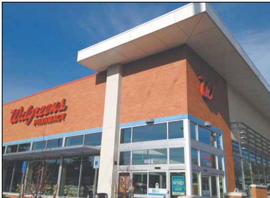
The new Walgreens at Barbur Crossroads opened in January. A grand opening is scheduled for March 8-9.

"There are only 300 of these stores in the nation," stated Alsvig, as he pointed out the immunization room. "We're striving to bear a resemblance to a clinic where almost all health insurance plans