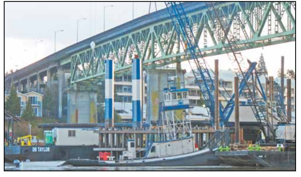
Detour bridge river work being done using a tugboat last month.

All of this has pushed the cost of the project up to just under $300 million, $10 million more than there are funds