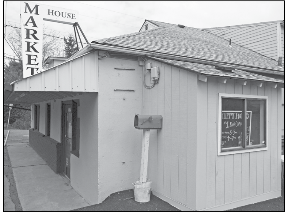
The owners of this building have applied for a liquor license for their new café & bar on SW Taylors Ferry Road, called Skippy's.