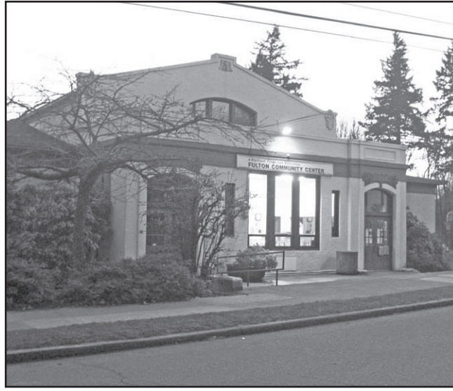
Fulton Park Community Center may be spared from proposed budget cuts by Portland Parks and Recreation.

The Markham Neighborhood Association may soon officially dissolve