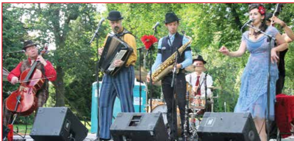
The Vagabond Opera performed July 20 at Willamette Park.