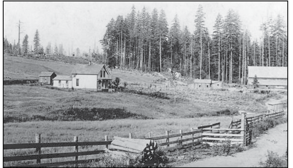
Hoffman house and barn, 1886, looking southwest from present day Vermont Street at about 52nd Avenue.