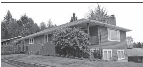
West Hills - Seymour Court $537,000

Sleek from the studs out remodel in 2007. Super clean lines w/ mid-century vibe, open floor plan & great sunset view from living. Fantastic attention to detail w/ quality touches & finishes throughout including hardwoods on main. Chef's kitchen w/ sliding door to deck, master on main & 3 fabulous full baths. Lower family room w/ bamboo floor.