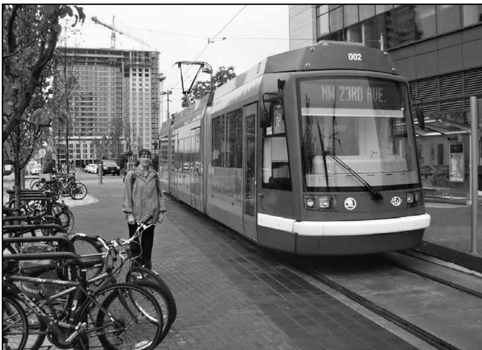
Portland Streetcar stops at Gibbs Street in the South Waterfront neighborhood.

The streetcar will make the Lake Oswego to downtown an estimated 10 minutes faster than existing bus service.