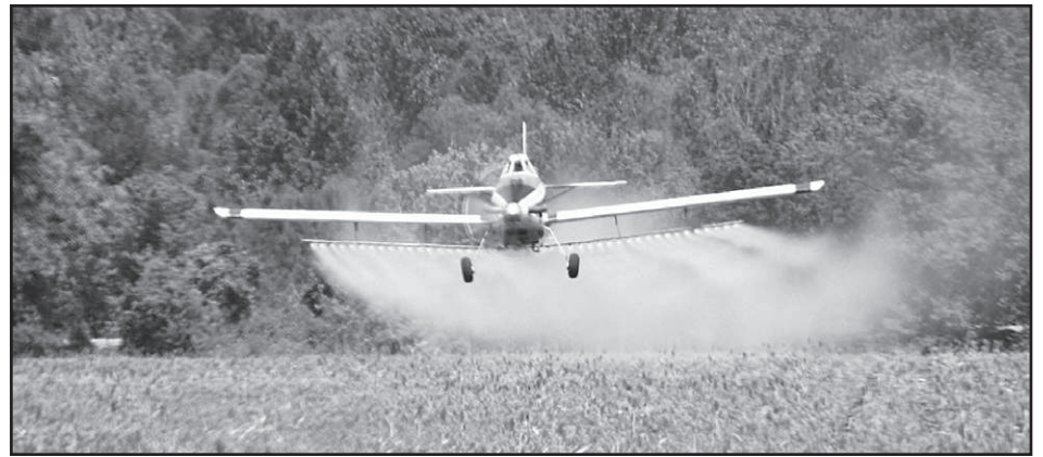
Synthetic agricultural chemicals became commonplace beginning with the so-called "Green Revolution."

A 2007 study of pollution in rivers around Portland, Oregon found that wild salmon there are swimming around with dozens of synthetic chemicals in their systems. Another recent study from Indiana found that a variety of corn genetically engineered to pro-