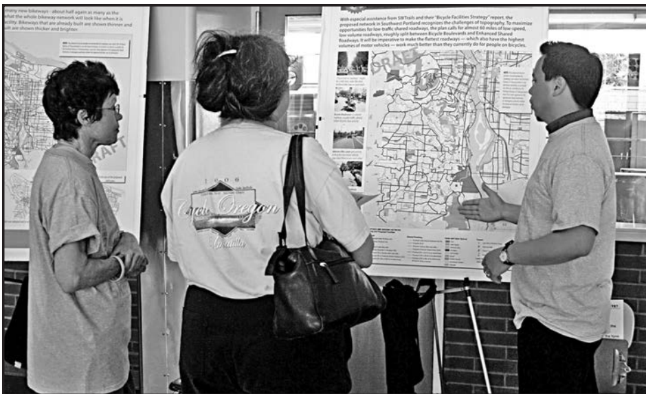
Proposed Southwest bicycle facilities attracted a lot of attention at the Open House.

She was a strong and consistent advocate for the disadvantaged. Her last requests were that donations in her name be made to Sisters of the Road, and that a keg of beer be served at her Celebration of Life, which was held May 21, 2009 at the Multnomah Arts Center.