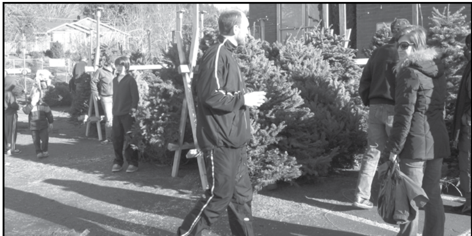
A fundraiser for Bridlemile School featured holiday trees and a pancake breakfast.