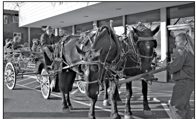
A carriage ride, courtesy of the Multnomah Village Business Association, outside Key Bank provided transportation back to the Multnomah Arts Center.