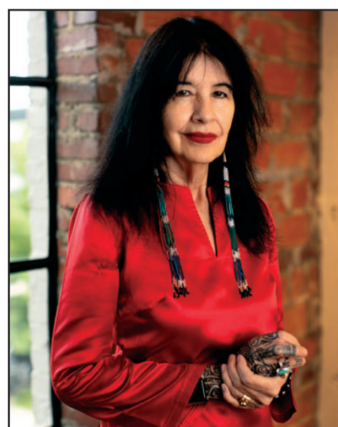
Joy Harjo

She is a chancellor of the Academy of American Poets and chair of the Native