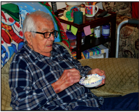
Sending a big thank you to all the friends and relatives who sang Happy Birthday at the Elders gathering to Dad for his 94 th birthday.