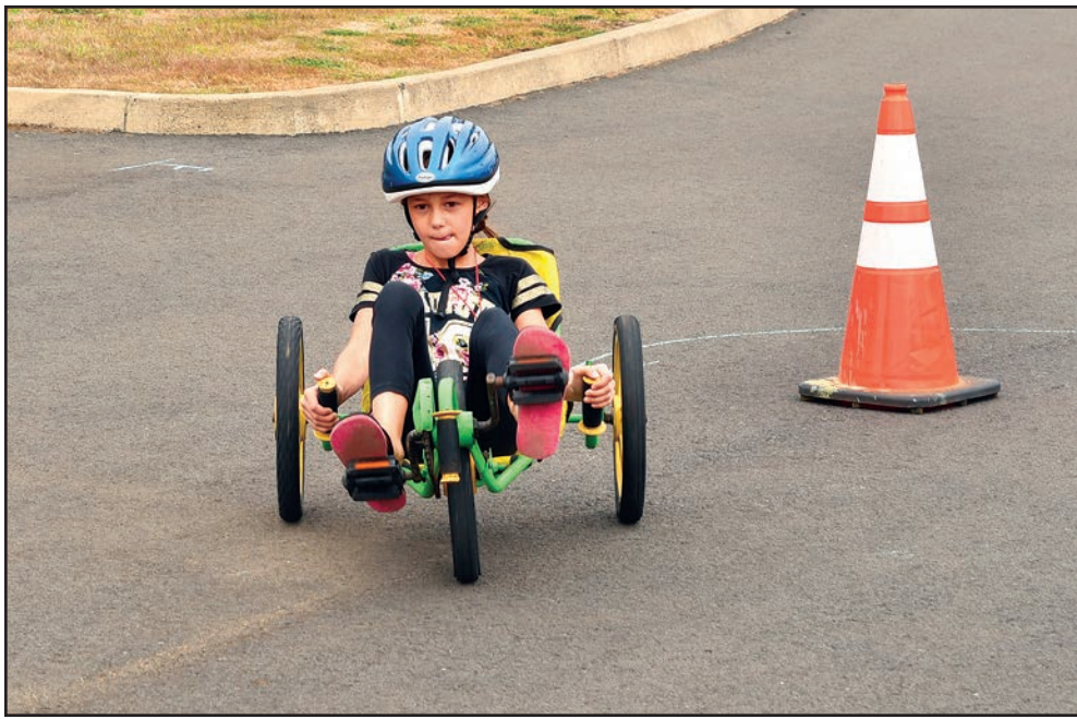
Wellness Carnival Aug. 30, 2018 Siletz Rec Center