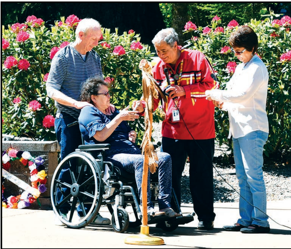
Memorial Day Ceremony May 28, 2018 • Paul Washington Cemetery