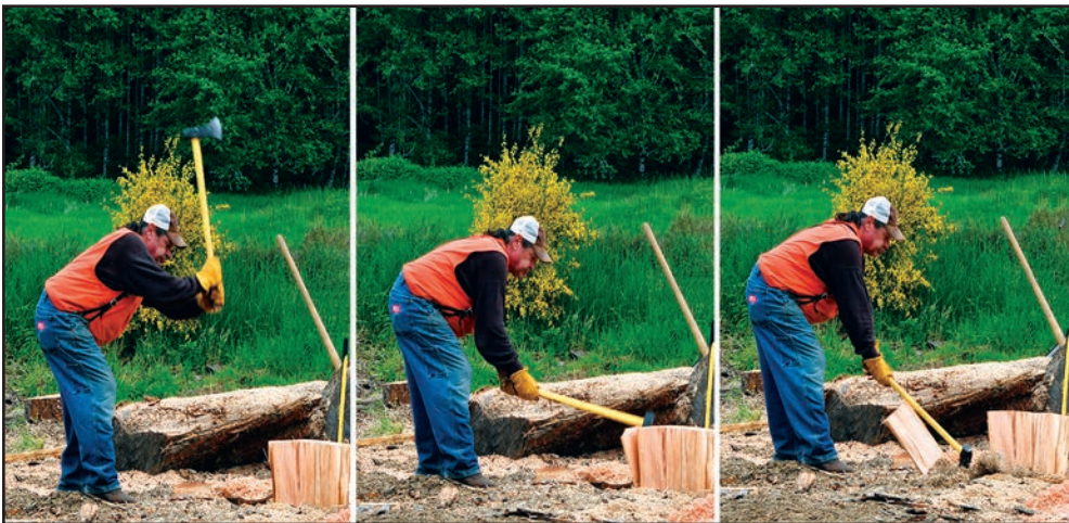
Elders Woodcut • May 19, 2018 • Siletz, Oregon