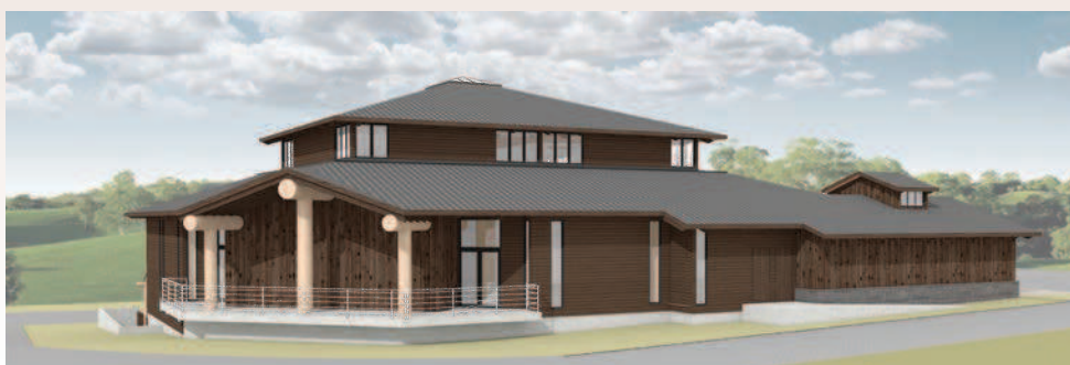
View from Southwest