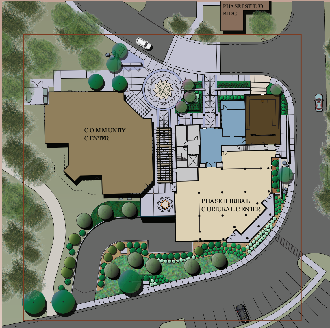
Site Plan - A VILLAGE OF STRUCTURES

The Siletz Tribal Cultural Center will be a place to preserve, promote, and practice our cultural heritage and spiritual beliefs as Siletz Indians. The idea of building a central cultural center or museum has been discussed and included as a goal of every major planning effort since Restoration. Throughout, community meetings have played an integral role in developing the framework for what the Center should become and what it should represent. The visioning process brought tribal members together in a series of interactive workshops which resulted in a Master plan and schematic design for the Center. The design and construction of the Phase I studio building followed in 2008. Upon completion, the Cultural Center will provide a cultural hub where Our true and whole story will be told to enlighten Indians and non-Indians as to the past, present, and future of the Siletz.