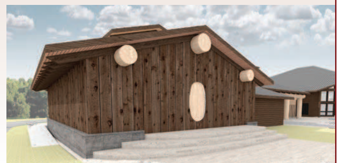
View of Plankhouse from Northwest