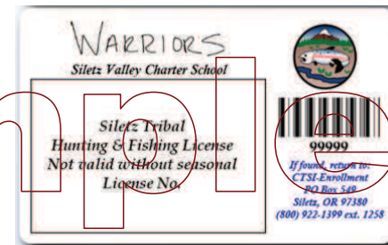
Back of Siletz Tribal ID card

There is now a $5.00 fee for a replacement ID card. Every tribal member is able to have one Tribal ID per calendar year at no charge. If you need to update your Tribal ID for a name change, new address, or an updated photo the Tribal ID is not considered a replacement card. Having a reprint of the same card that was previously issued within the same calendar year is considered to be a replacement card that would require the $5.00 fee to be paid. Staff will take into consideration catastrophic events for loss of a Tribal ID card to waive the replacement fee.