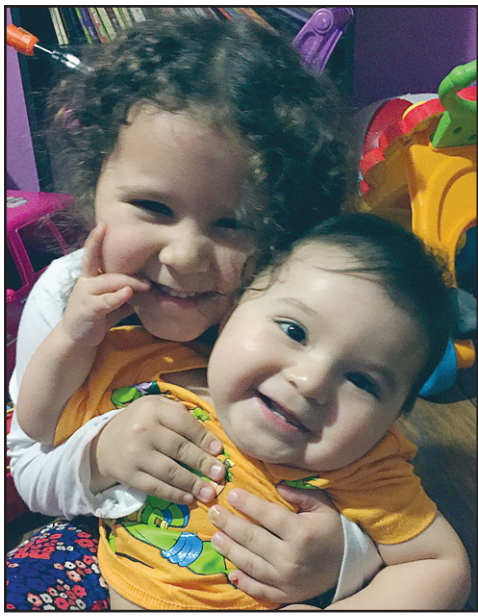
Happy Birthday, babies! We love you!