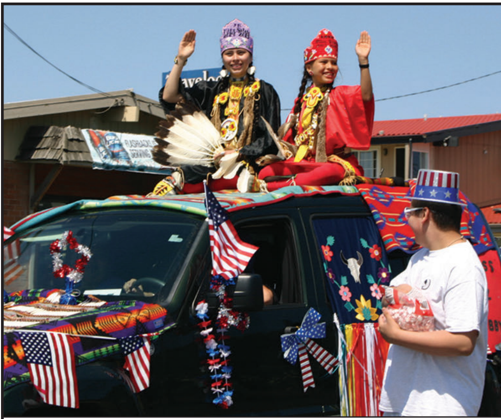
Loyalty Days Parade May 2, 2015 • Newport, Oregon