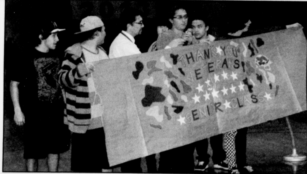
Veterans Ceremony Siletz Valley School • Nov. 8, 2013