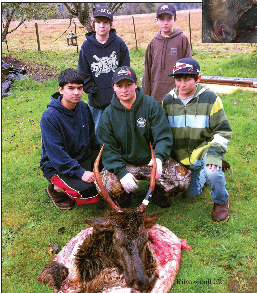
Rilatos bull elk