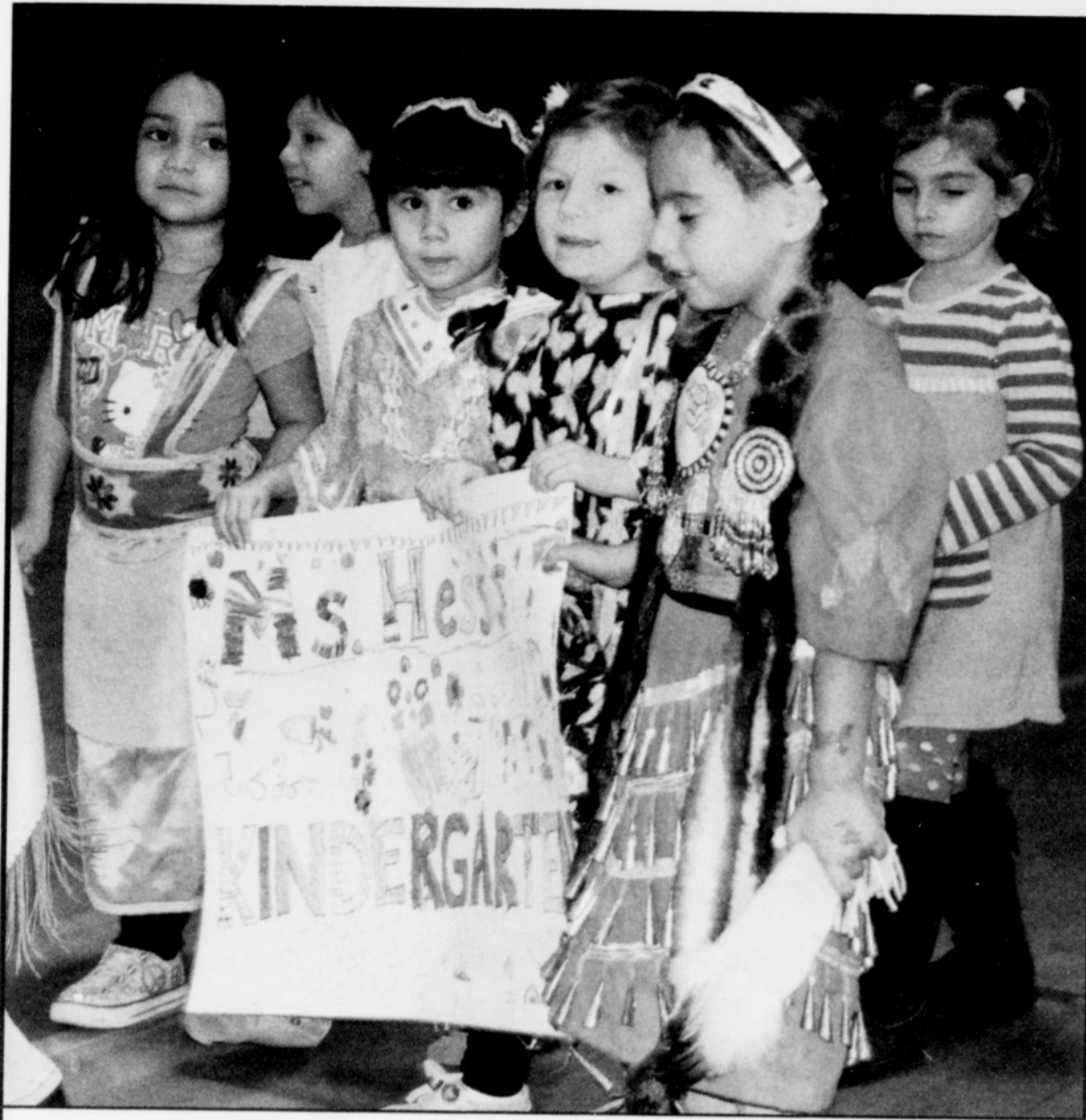
Mini Restoration Pow-wow Siletz Valley Schools Nov. 15, 2012