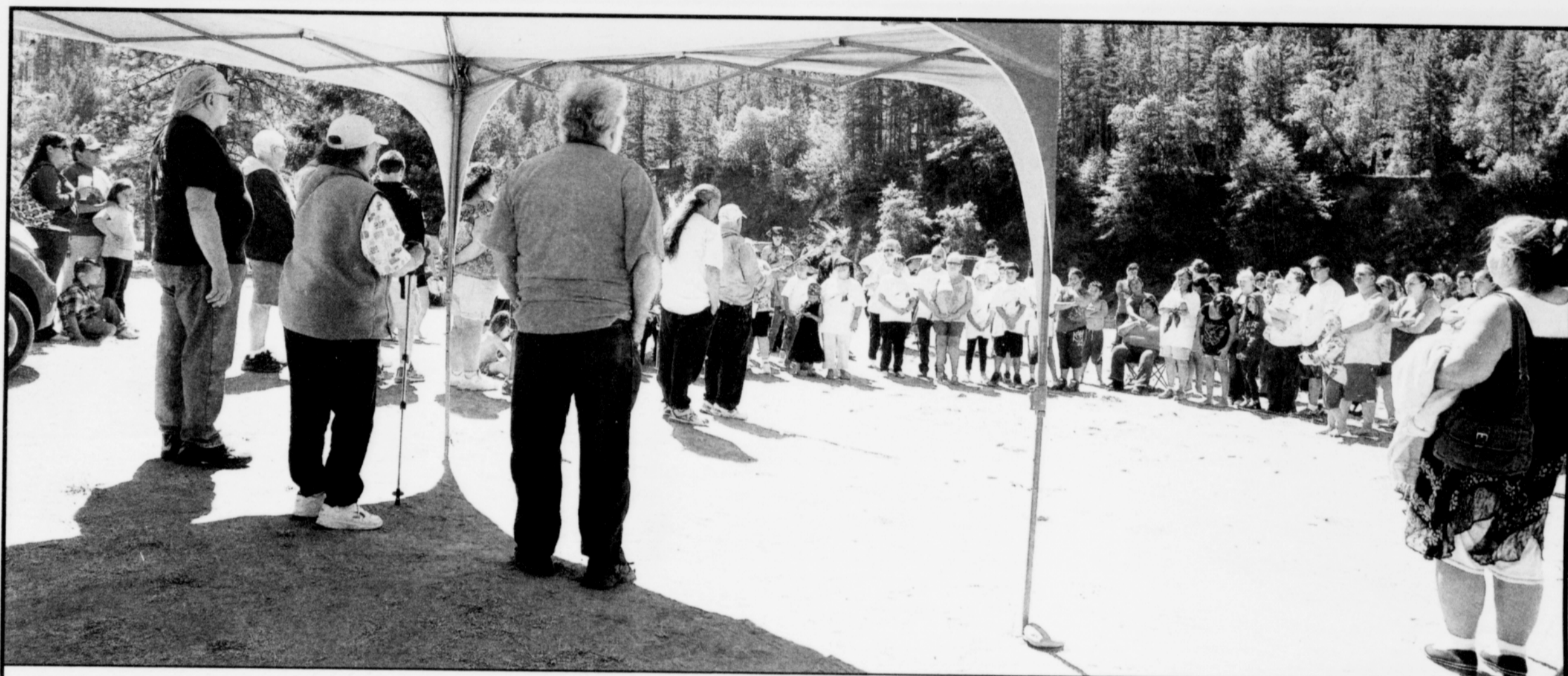
Participants gather at the end of Run to the Rogue near the Illinois River in southwest Oregon. See more photos from the event on pages 9-20.