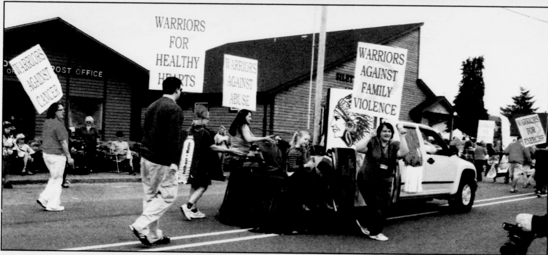
Siletz Community Health Clinic float